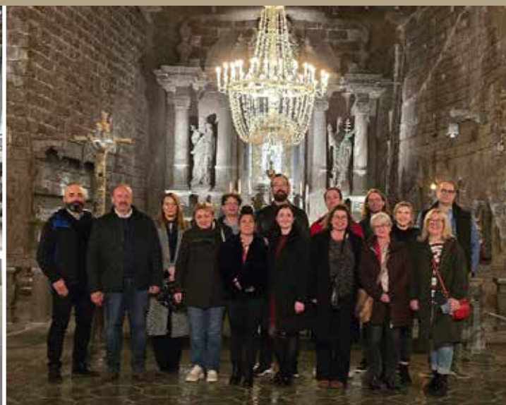
Out and about with a visit to Vivergo bio ethanol plant (left) and an recent meeting with other assurance bodies in Krakow (right)